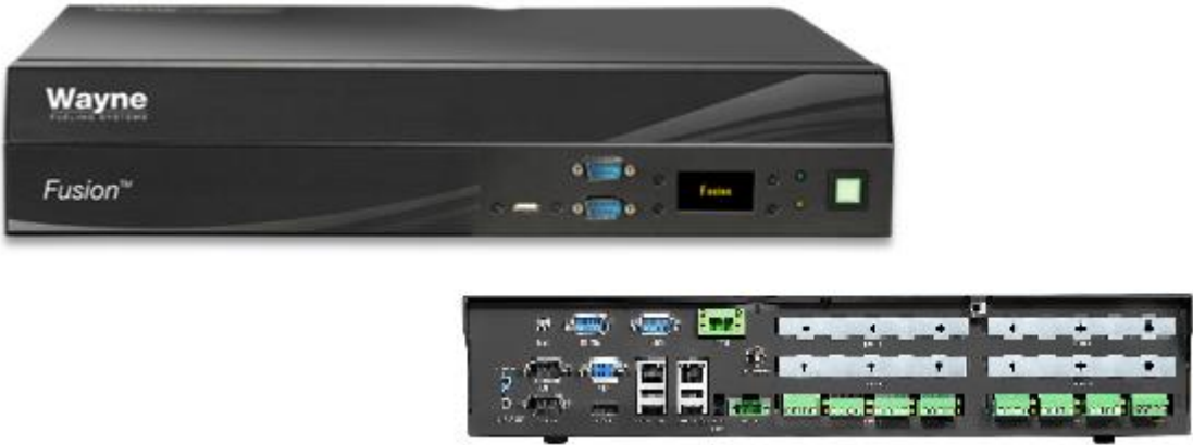
Fusion Forecourt Controller