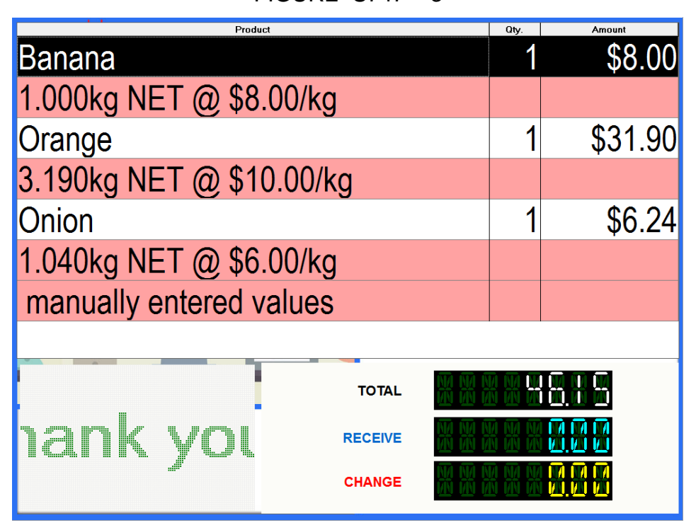
Typical Customer Display