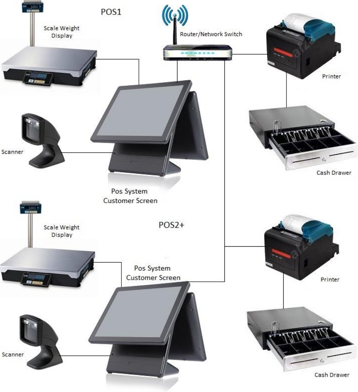
Point of Sale (POS) System