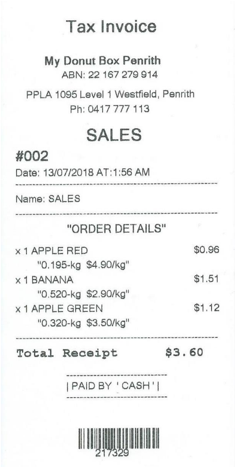
A Typical Receipt