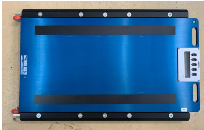
(a) Dini Argeo Model WWS Weighing Instrument