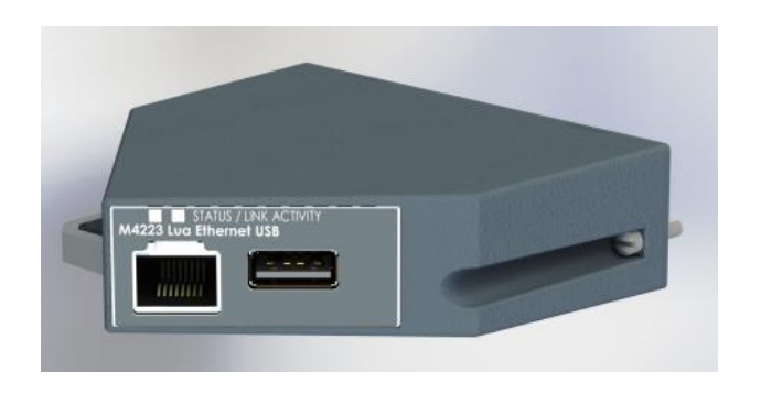
FIGURE S463 - 7

Rinstrum Models M4222 or M4223 LUA Ethernet and USB Interface