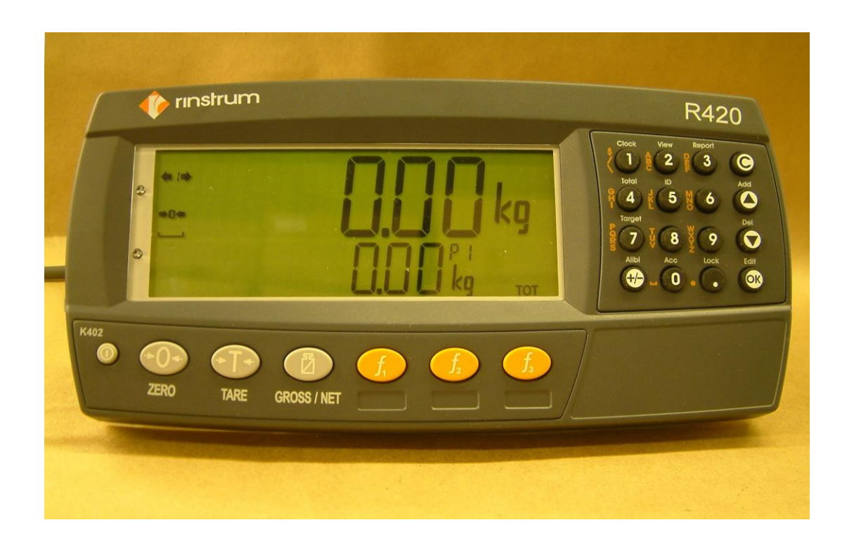
FIGURE S463 - 1

Rinstrum Model R420 Digital Indicator (pattern)