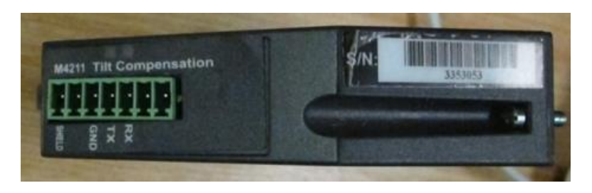
FIGURE $463 - 5

Rinstrum Model M4211 Tilt Compensation Module (variant 4)