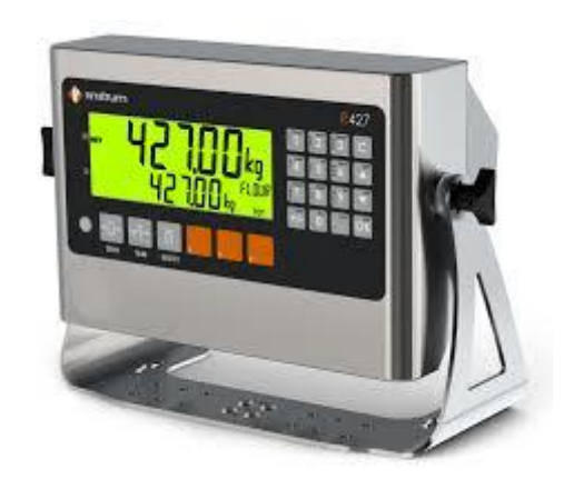
FIGURE S463 - 6

Rinstrum Models R427 or R457 Digital Indicator (variants 8 and 9)