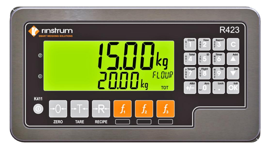
FIGURE $463 - 3

Rinstrum Model R423 Digital Indicator (variant 3)