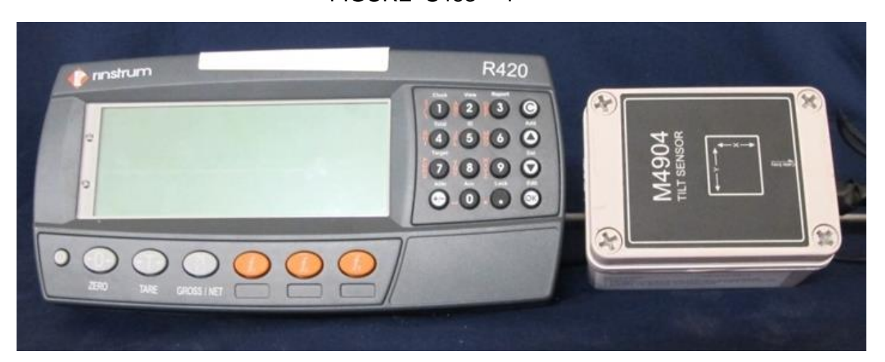
FIGURE S463 - 4

Rinstrum Model R420-K491 Digital Indicator & Model M4904 Tilt Sensor (variant 4)