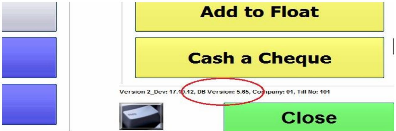
DB Software Version 5.XX