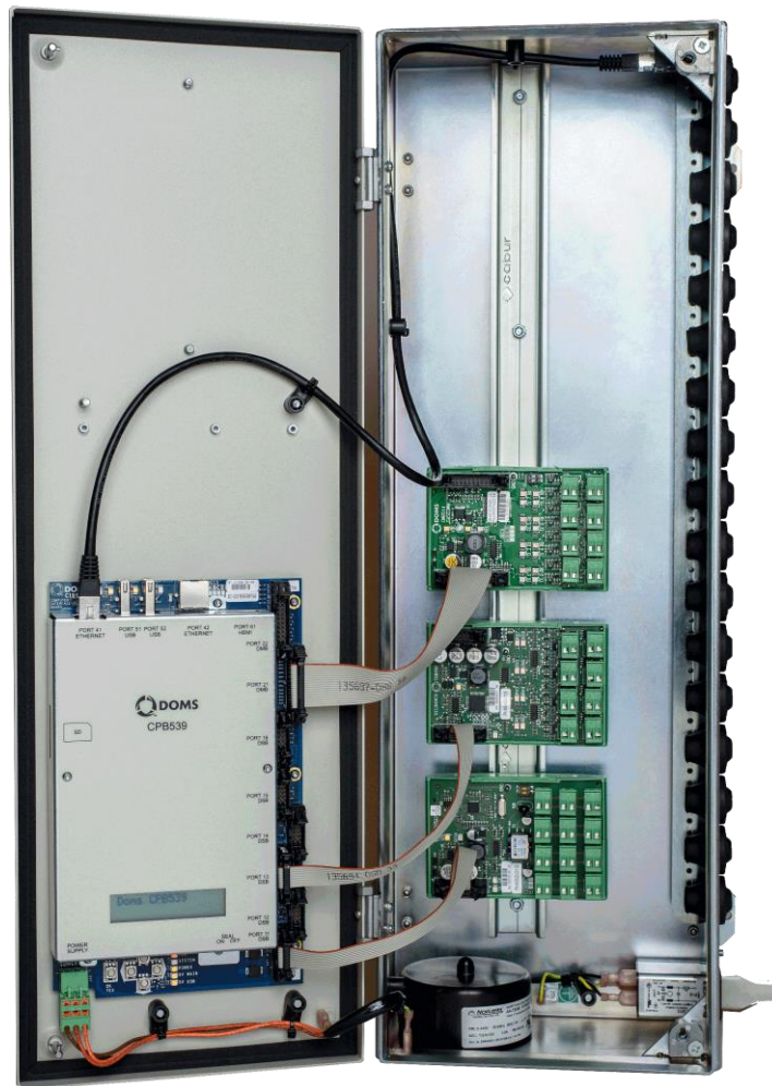
DOMs Model PSS5000 Controller