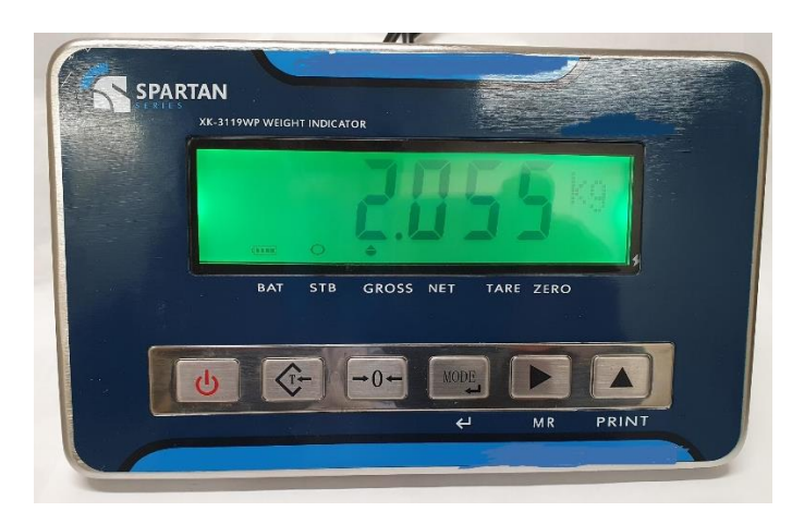
FIGURE S829 - 1

National Weighing Instrument Model Spartan XK3119WP-PRO Weighing Indicator (Pattern)