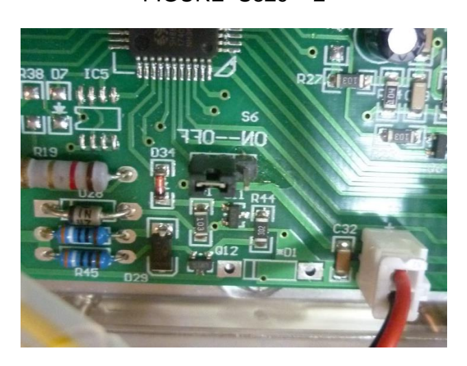
Jumper JP1 Sealing